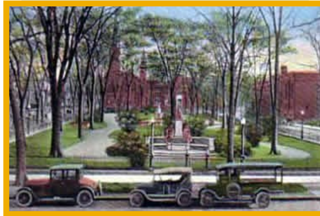
Fayette Park 1920's

~ The Park was a popular place at all times of the day, but it was reported that there was not enough seating for all who wanted to enjoy the park and fountain in the evening hours.