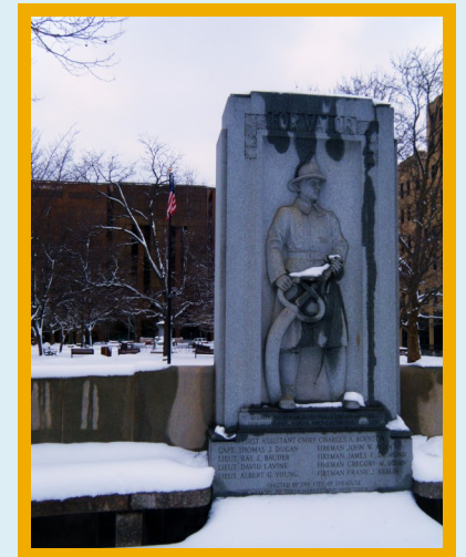
On the east end of park is a monument to all firefighters who have died in the line of duty

~ Syracuse firefighters created a circle of bricks around the flagpole called the Circle of Supreme Sacrifice. Each brick is engraved with the name of a City of Syracuse firefighter who lost his life in the line of duty.