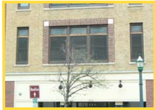
218 West Genesee St. Apartments

The Erie Canal once ran through Clinton Square, making it a center of business activity. Clinton Square continues to be the center of the community today, with festivals held in the Square nearly every weekend throughout the summer, as well as the Downtown Farmers' Market every Tuesday in the summer.