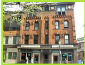
Kirk Hotel Bldg. Apts. 127 W. Fayette St.

CONTACT: Washington Street Partners @ 315-426-2624