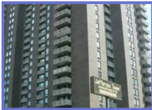
Jefferson Tower 50 Presidential Plaza

Presidential Plaza, on the eastside of downtown, consists of multi-story apartments and townhouses. Presidential Plaza's proximity to the hospitals on University Hill makes it a popular home for medical students and doctors.