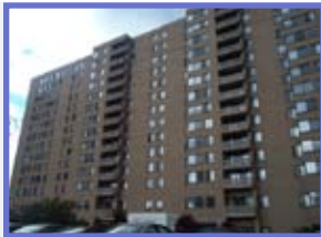
Madison Towers 60 Presidential Plaza