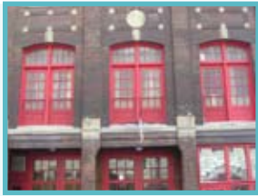
Firehouse #1 Condos 106 Montgomery St.