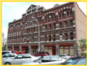
The Amos @ Clinton Sq. 214 W. Water St.