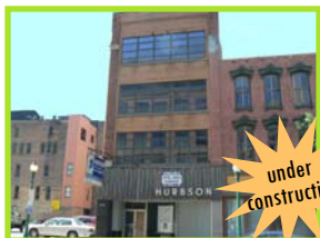
The Residences at Walton 215 W. Fayette St.

CONTACT: Armory Development Corp. @ 315-422-5381