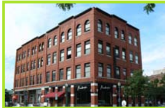
Eddie Butler Building 304 W. Jefferson St.

CONTACT: Regional Facilities Mgmt. Svcs. @ 877-525-0452