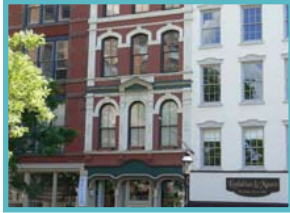
Hanover Square Lofts 131 E. Water St. & 136 E. Genesee St.