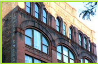
Butler Building Apts. 319 S. Clinton St.

12 apartments: 3 1-bedroom & 9 2-bedroom units