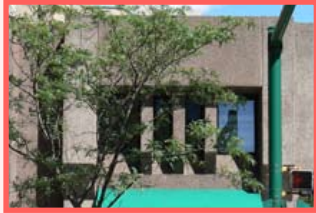
359 South Salina Street

South Salina Street runs through the middle of downtown Syracuse and has been a main thoroughfare throughout Syracuse's history. Many of the buildings along Salina Street were once department stores, but now have been converted into a mix of residential units on upper floors and retail and office space on lower floors.