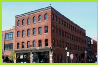
202 Walton Street

NO. OF UNITS UNIT SIZE AMENITIES PARKING RENT RANGE