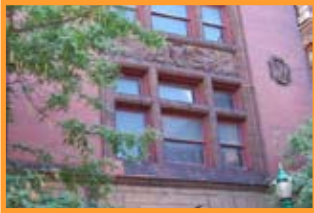
311 Montgomery Street Luxury Apartments

NO. OF UNITS UNIT SIZE AMENITIES PARKING RENT RANGE