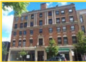
Clinton Square Suites 230 W. Genesee St.