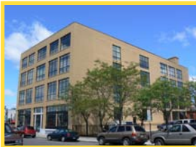
Lofts on Willow 230 W. Willow St.

CONTACT: AJF Real Estate Devel. @ 315-476-9643 or cazavagi@gmail.com