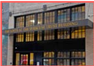
Syracuse Trust Condos 325 S. Salina St.