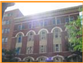
Masonic Lofts 320 Montgomery St.

32 apartments: 1 one-bedroom & 31 two-bed- room units