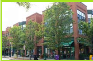
Center Armory 133 Walton St.