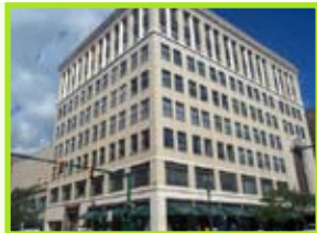
Loew's Residential Suites 108 W. Jefferson St.

CONTACT: Armory Development Corp. @ 315-422-5381