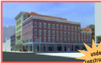
Pike Block 300 S. Salina St.