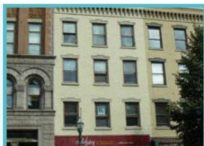
123 East Water Street

NO. OF UNITS UNIT SIZE AMENITIES PARKING RENT RANGE