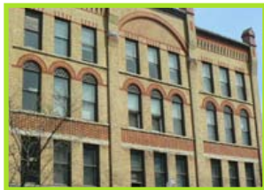
Labor Temple 309 S. Franklin St.

8 apartments: 2 1-bedroom & 6 2-bedroom units