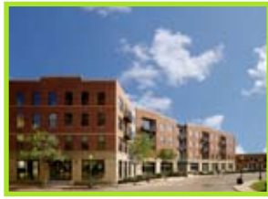
Jefferson Clinton Commons 500 S. Clinton St.

apartments in beautifully renovated buildings. Residents of Armory Square enjoy access to transportation, museums, live performances and art galleries right at their fingertips.