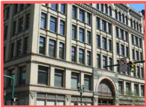
Dey's Plaza Apts. 401 S. Salina St.