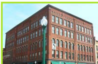
Hogan Block 247 W. Fayette St.

22 apartments: 1 studio, 18 1-bedroom & 3 2-bedroom units