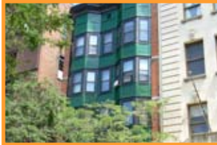
317 Montgomery Street Apartments

4 apartments: 3 one-bedroom & 1 two-bed- room units